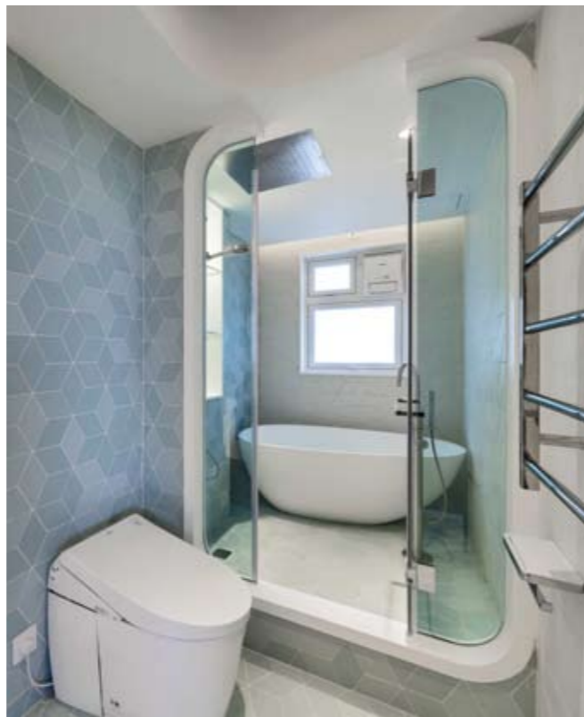
Text: Zaira Abbas

The bedrooms for the two daughters are equally appealing, each with her own personal touch to match their contrasting tastes and preferences. One daughter enjoys the shades of blue which is aptly, so cool shades that decorate the textured walls and carpet to reflect