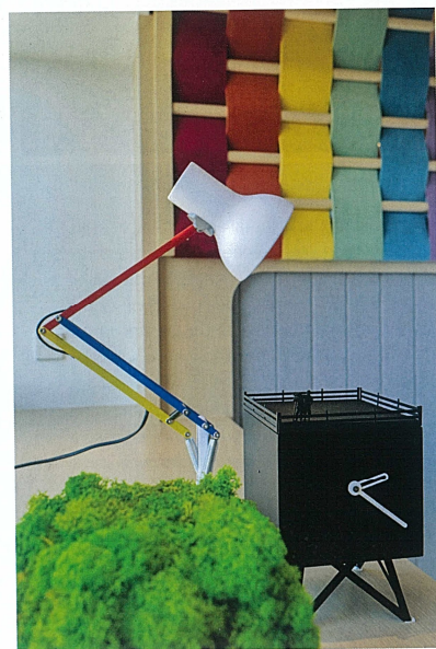
Text: Zaira Abbas

The reconfiguration enables each child to have their own walk-in closet, their own desk set beside the window and their own sleeping quarters, which is raised above the floor and accessed by separate